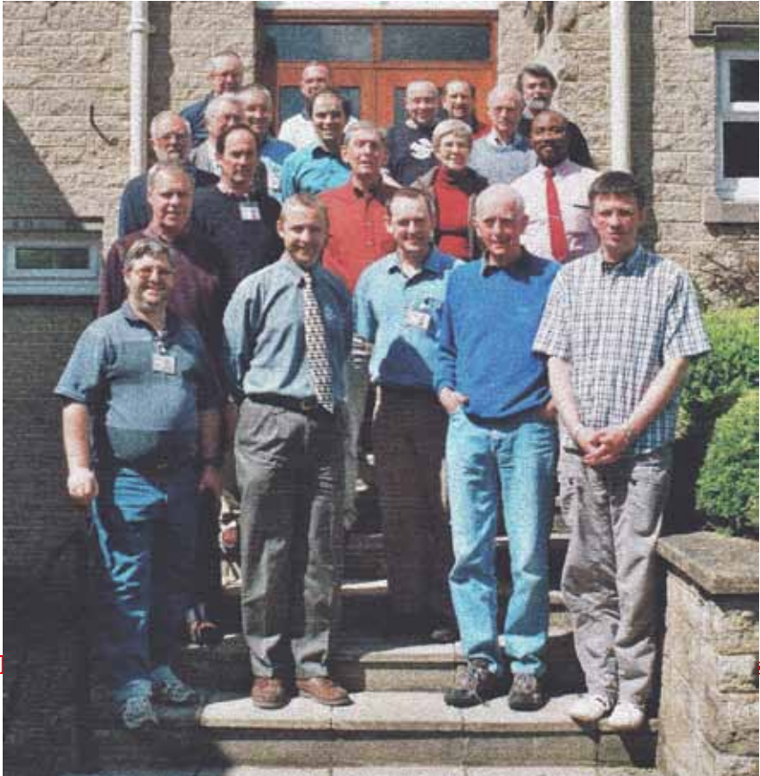
A group of staff and students c2002

If my arithmetic is correct forty-five people attending courses during the time I was a staff member. Together they represented ordained (30) and lay workers (15) diversely involved in eight denominations; the staff represented three denominations; visiting lecturers five or more. Consequently the courses were ecumenical although there were more Methodist students than of any other denominations. Disappointingly, despite all our efforts to recruit equal number of men and women, only nine of the students were women. Of forty-five students nineteen went on to take MA degrees, two with distinctions; most of the others qualified for diplomas. Details of all this are in the files in my archives. Also there are seminar papers, dissertations and notes on my tutorial sessions in my Archives.